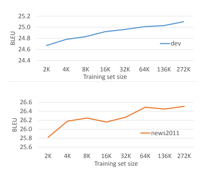
Figure 3: Effect of increasing the training set size from 2,000 to 272,000 sentences measured on the dev set (top) and news2011 (bottom) in an n-best list rescoring setting.

For this experiment only, we measure accuracy in a re-ranking framework for faster experimentation where we use the 100-best output of the baseline system relying on a likelihood-based hierarchical reordering model. We re-estimate the log-linear weights by running a further iteration of MERT on the n-best list of the development set which is augmented by scores corresponding to the discriminative reordering model. The weights of those features are initially set to one and we use 20 random restarts for MERT. At test time we rescore the 100-best list of the test set using the new set of log-linear weights learned previously.